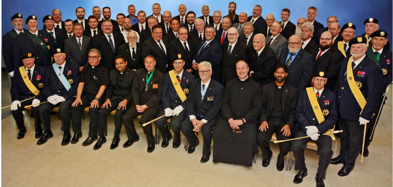
Relic of the True Cross Procession