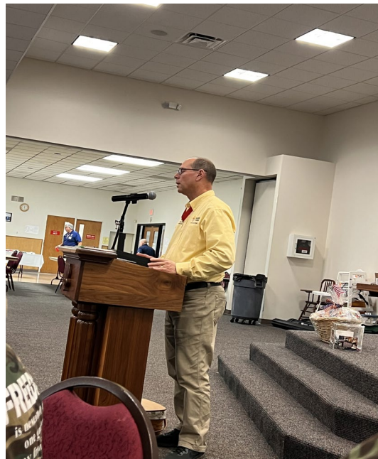
District 1 Meeting and Packing Party