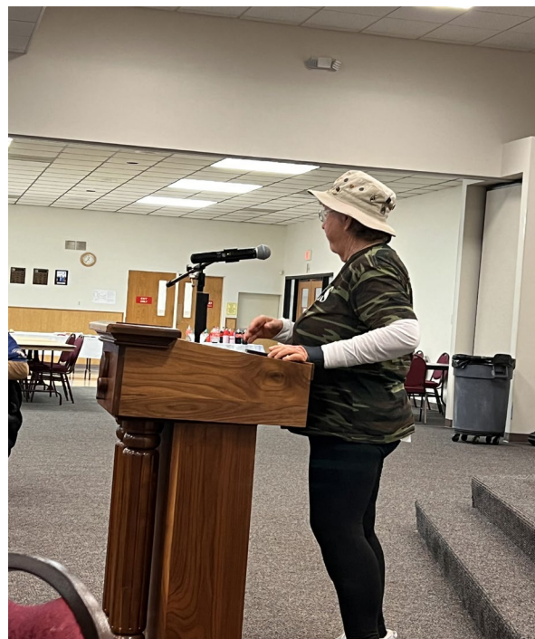
District 1 Meeting and Packing Party