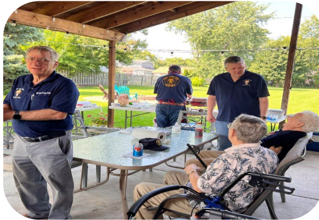
Food and Fellowship