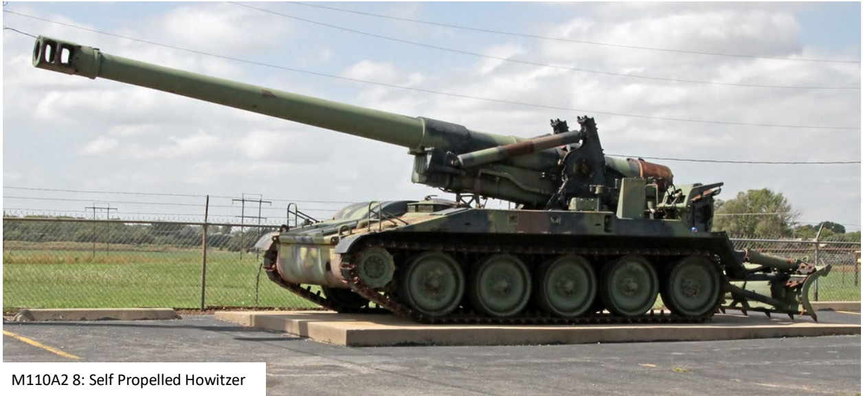
M110A2 8: Self Propelled Howitzer