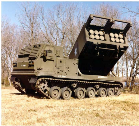
MLRS with standard rocket pod