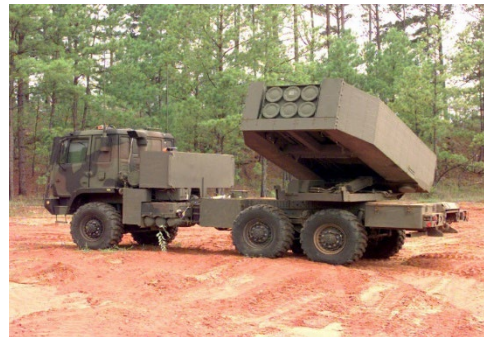
HIMARS, current weapon system of the 1-182 nd BN