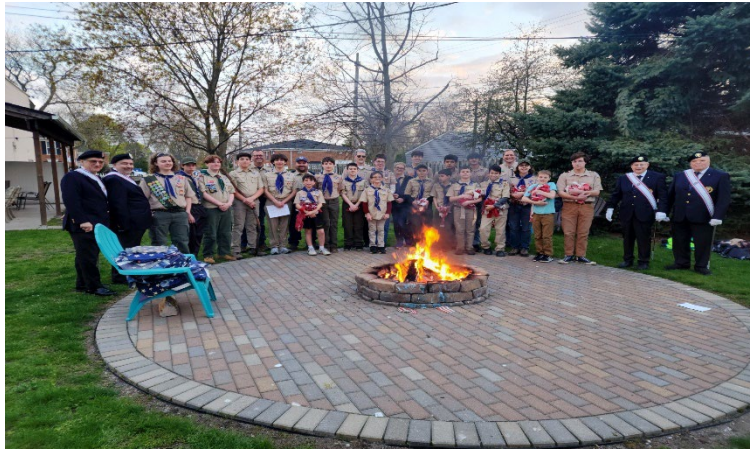
Flag Retirement with Troop 473