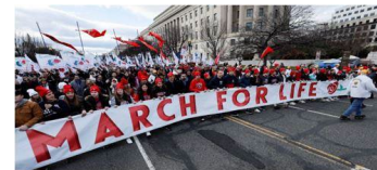
State Officers in DC for March for Life 2023